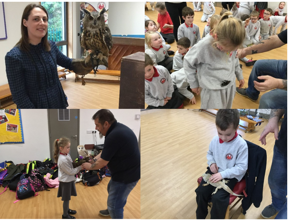
Primary 2 were joined by some of the other classes when 'World of Owls' came to visit. We are learning all about owls for our World Around Us topic.